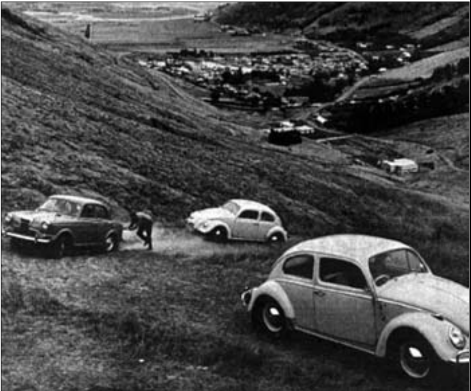
The convoy of cars negotiating a steep turn halfway up the Christchurch side of the Bridle Path. Heathcote Valley is in the background.

So they've been tackling it with cars—not beat up old bombs or four-wheel drive utilities—but late model vehicles with spotless paint and shining chrome. And after a number of unsuccessful attempts they