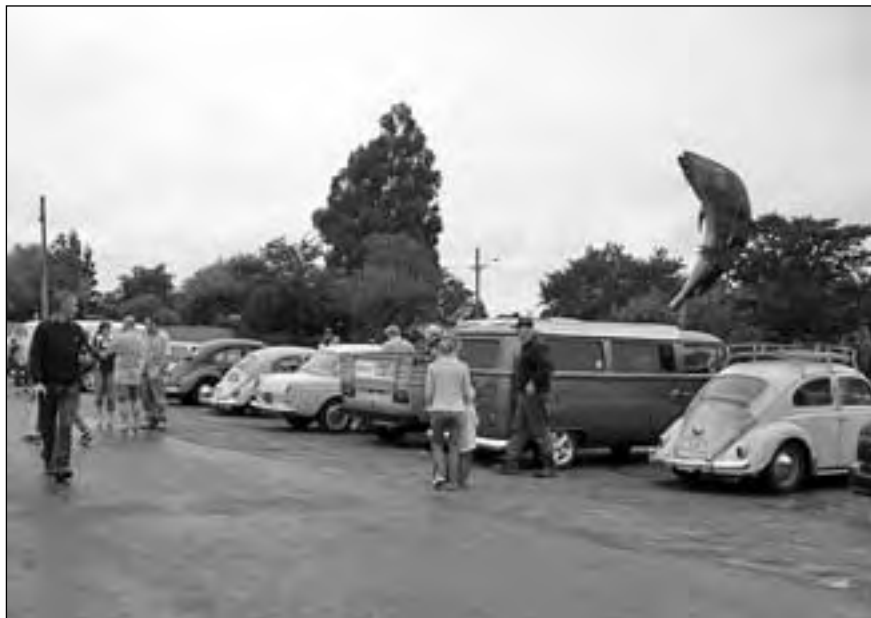
Above: Getting ready to 'Run for Cover' in Rakaia Lots of convoy fun.