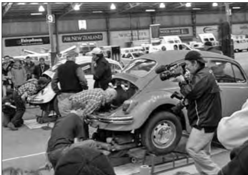
Below: It's all action in the engine change competition.