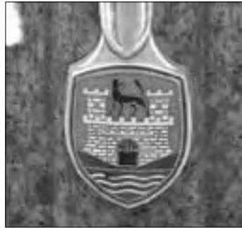
Chrome and rusty patina, the perfect counterparts.